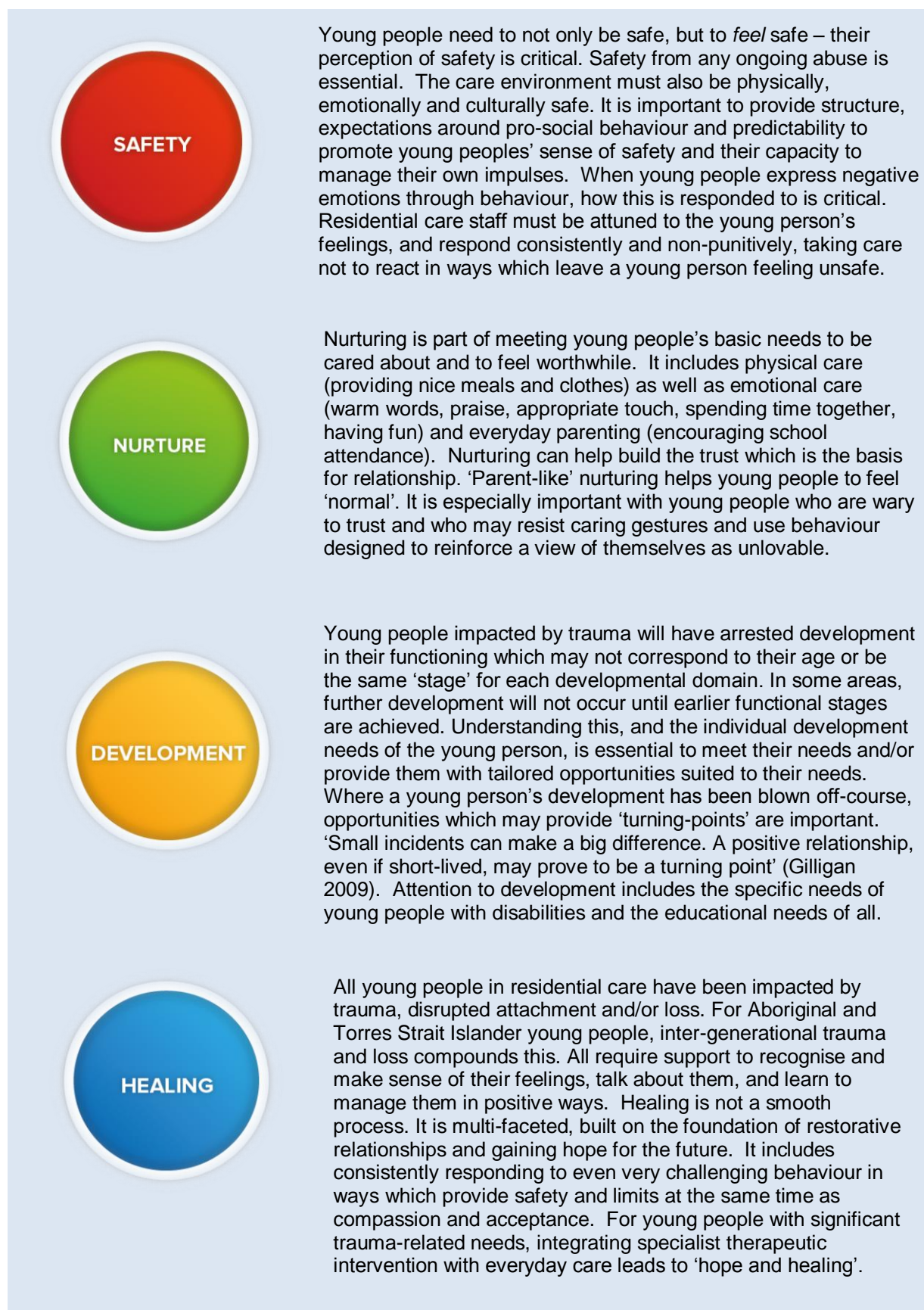
Figure 1: Fundamentals of residential care