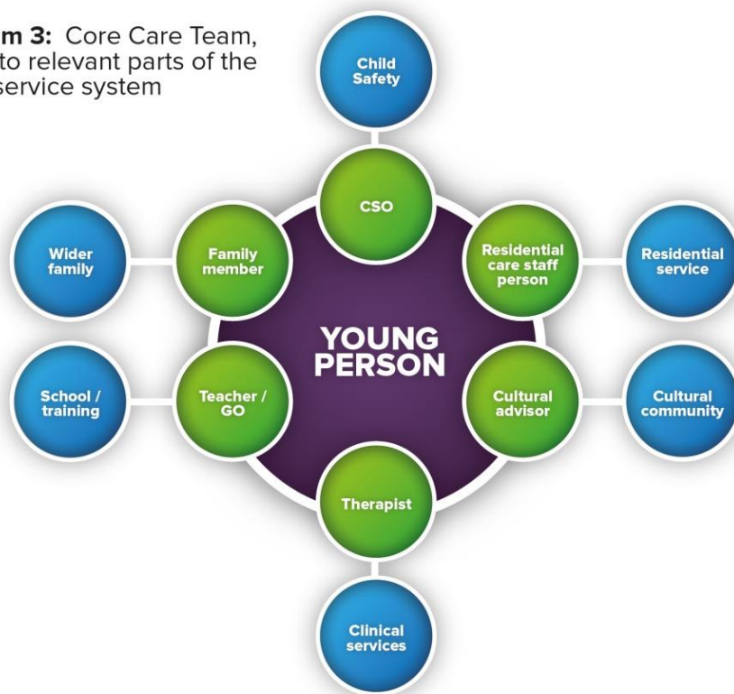
Diagram 3: Core Care Team, linked to relevant parts of the wider service system