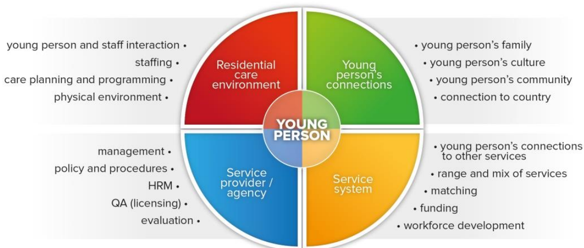
Diagram 2: The domains of residential care

OVERARCHING ACROSS ACTIVITY IN EACH DOMAIN: CULTURAL PROFICIENCY / CONGRUENCE