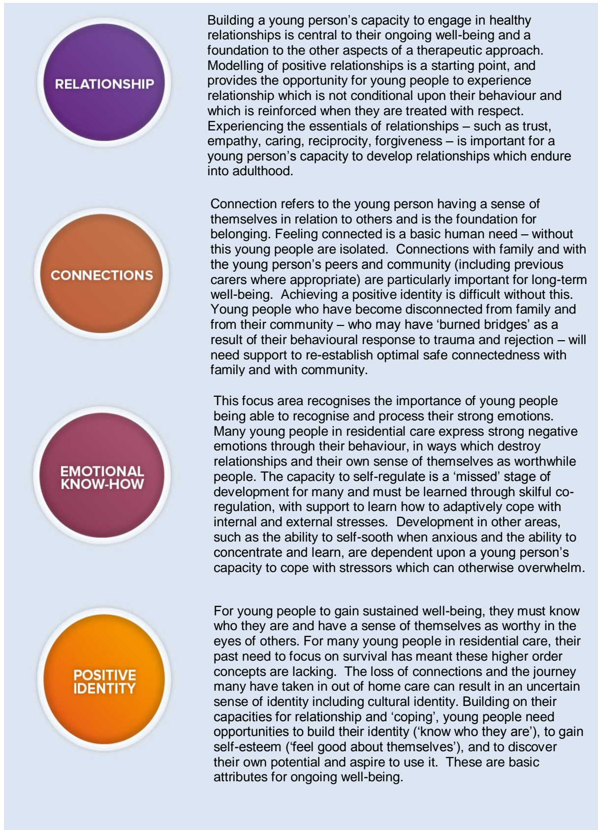
Figure 2: Focus of a therapeutic approach