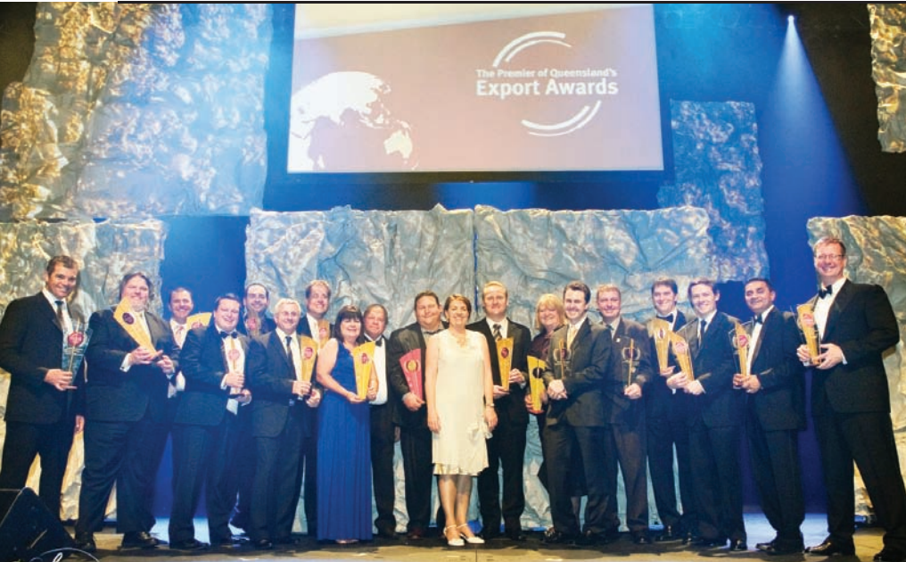
Premier Anna Bligh with winners of the 21st Premier of Queensland Export Awards.